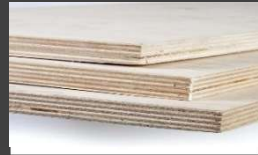
3/4" Advantech Floor