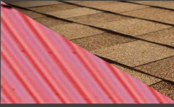
Timberline Shingle or Metal Roof